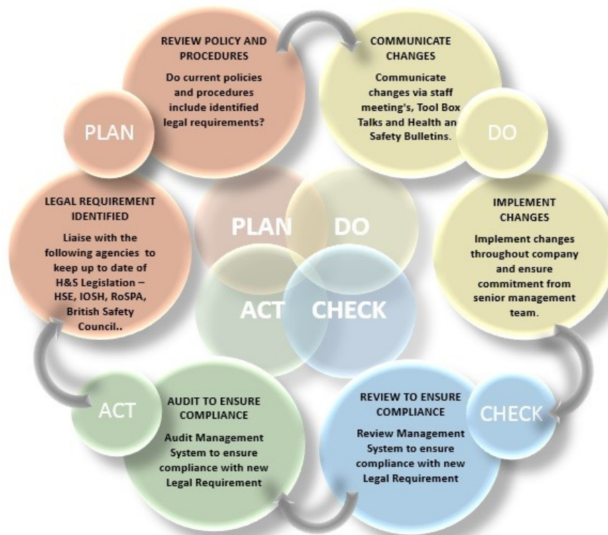
Figure 1 Summary of Plan / Do / Check / Act operating methodology.

In the following model highlighting leadership responsibility, it is likely that an individual may have multiple responsibilities participating at the strategic level and enabling at the operational level reflecting their particular role within the University. Each role descriptor has elements of Plan / Do / Check / Act and these have been aligned to allow a targeted, proportionate and efficient approach to robust, sensible, risk control.