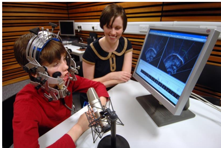
A picture of the special computer