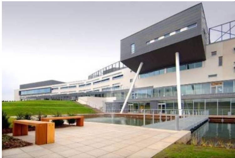
Queen Margaret University